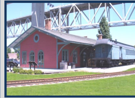
Thomas Edison Depot Museum 510 Edison Parkway Port Huron, MI 48060