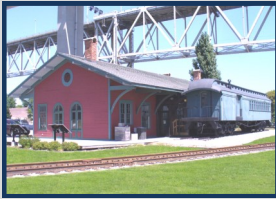
Thomas Edison Depot Museum 510 Edison Parkway Port Huron, MI 48060