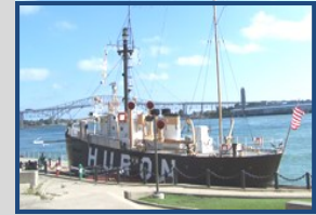
HURON Lightship Pine Grove Park 800 Prospect Place Port Huron, MI 48060