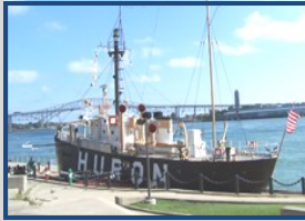
HURON Lightship Pine Grove Park 800 Prospect Place Port Huron, MI 48060