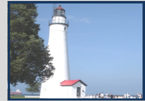
Fort Gratiot Light Station 2802 Omar Street Port Huron, MI 48060